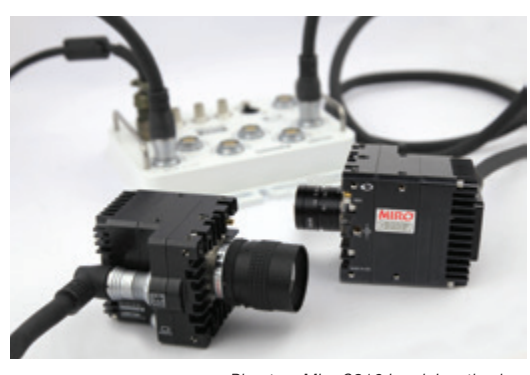
Phantom Miro C210J and Junction box

Small, light, and rugged, the Miro C210J is designed for tough and difficult situations , such as automotive on-board applications. It uses just a single cable to connect to the Miro Junction Box (JBox). The Miro C210J is also versatile. It can be connected to