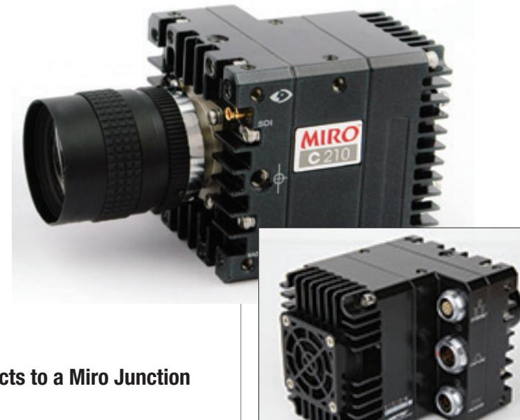
Phantom Miro C210

The Miro C210 is ideal for single camera applications requiring a small, light, and rugged camera. With three connections for Ethernet, Power, and Capture, it is compatible with all cables for Miro cameras. It comes with a power supply and MiniBoB to connect to the Capture connector. The MiniBoB is a simple and reliable way to control the Miro C210 with Trigger, IRIG in, IRIG out, F-Sync, Ready, Strobe, Event and Memgate signals, greatly enhancing the Miro C210's capability. Alternatively, the camera may also connect directly to a computer via Ethernet.