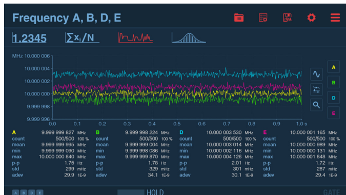
View 4 signals simultaneously on screen. 4 instruments in one!

Measured values are presented as both numerics and graphics. The graphical presentation of results (distribution, trends etc.) gives a better understanding of the nature of jitter. It also provides you with a much better view of changes vs time, from slow drift to fast modulation. The same data set can be viewed in Numerical, Statistics, Distribution and Time-line views. It is very easy to capture and toggle between views of the same data set.