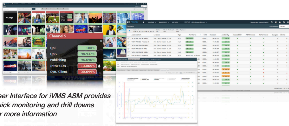
User Interface for iVMS ASM provides quick monitoring and drill downs for more information